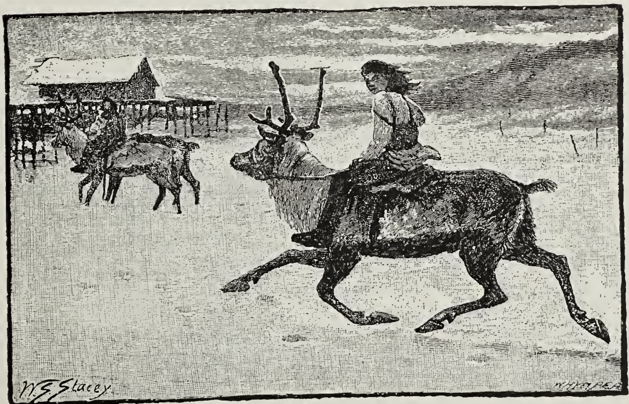
Reindeer under Saddle.